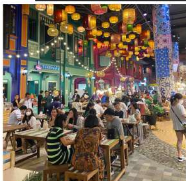
The New Year's Eve - Thailand. Druti Banerjee