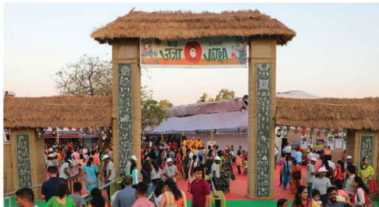
Bhimthadi Jatra '22.

"Last year, we intentionally put up fewer stalls, in the wake of the