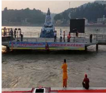
The Holy City gears up for G20.

The holy city of Rishikesh is set to host the events in May and June. Chief Minister Pushkar Singh Dhami has expressed his gratitude for the opportunity, and said the summit will