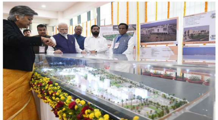
Development project on the go in Nagpur. Twitter.

The list of New year gifts for Nagpurkars includes, the inauguration of Phase I Nagpur metro which includes 2 metro train lines i.e. Aqua line from Lokmanya Nagar to Prajapati Nagar and Orange Line from Khapri to Automotive square, Laying foundation stone for Phase II of Metro, which in turn is a leeway for redevelopment of Nagpur and Ajni Railway station, Flagging off the 6th Vande Bharat train between Nagpur in Maharashtra and Bilaspur in Chattisgarh, PM Narendra Modi inaugurated these projects and is expected to be invited back soon for the airport modernization project. The PM also laid the ground for Pollution Abatement for the Nag River Project under the National River Conservation Plan. To enhance the tourism sector in Nagpur, Futala lake has been adorned with the largest Futala fountain and music show and infrastructure like floating restaurant to be made. The sudden boom in the Infrastructure projects