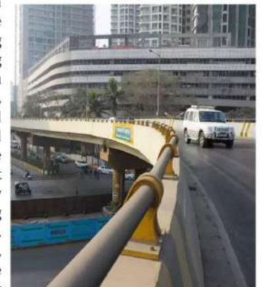
Infrastructural enhancement in the orange city.

economical. This infrastructure project has not only benefited the people of Nagpur but also marked its presence in Guinness Book of World Records recently by constructing the longest double decker viaduct metro." Said a source from Nagpur Metro Rail Project.