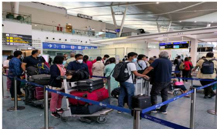
Pune airport amidst the festive season packed with passengers.