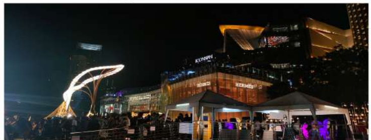
The New Year's Eve - Thailand. Druti Banerjee.

The celebrations for New Year in Thailand is one of the most popular times for the country to receive a surge in tourism, and according to KAYAK, one of the World's leading travel search engines, Indians top the list of being the most to enter the country to celebrate their start to a New Year. Thailand, among most travel locations around Asia, is the