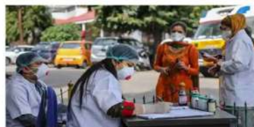
Alarming increase in the COVID cases.

Maharashtra health minister, Tanaji Sawant, has issued a 5-point programme to deal with the possible covid outbreak. The programme includes: test, track, treat, vaccinate and ensuring covid appropriate behaviour. The Health Ministry has issued precautionary guidelines for the vulnerable sections of the society. Kids, the elderly and people with chronic diseases have been told to take extra precautionary measures.