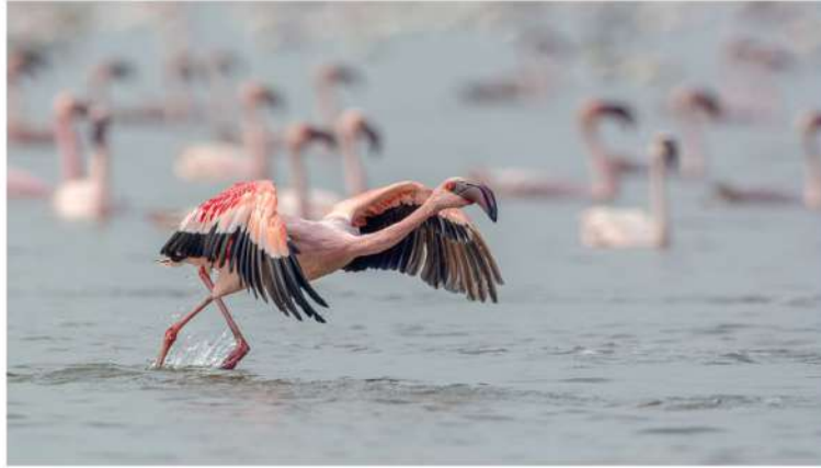
Flamingo season in Thane.

It was only in the 1990s flamingos began to fly in large numbers to Mumbai. As the city expanded in the 1970s and 1980s, the amount of untreated sewage flowing into Thane Creek increased, fostering the algae that serve as the flamingos' primary source of food and transforming the area into a feeding site for the birds.