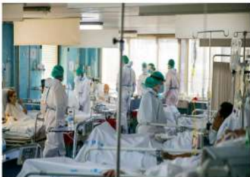
The pandemic crisis rises.

Mumbai: Amid a rise in cases, the government has decided to reintroduce Covid19 testing for International travelers. The active tally for cases in Mumbai city stands at 51. JJ hospital and Seven Hills hospital conduct mock drills as the state gears up for the New Year.