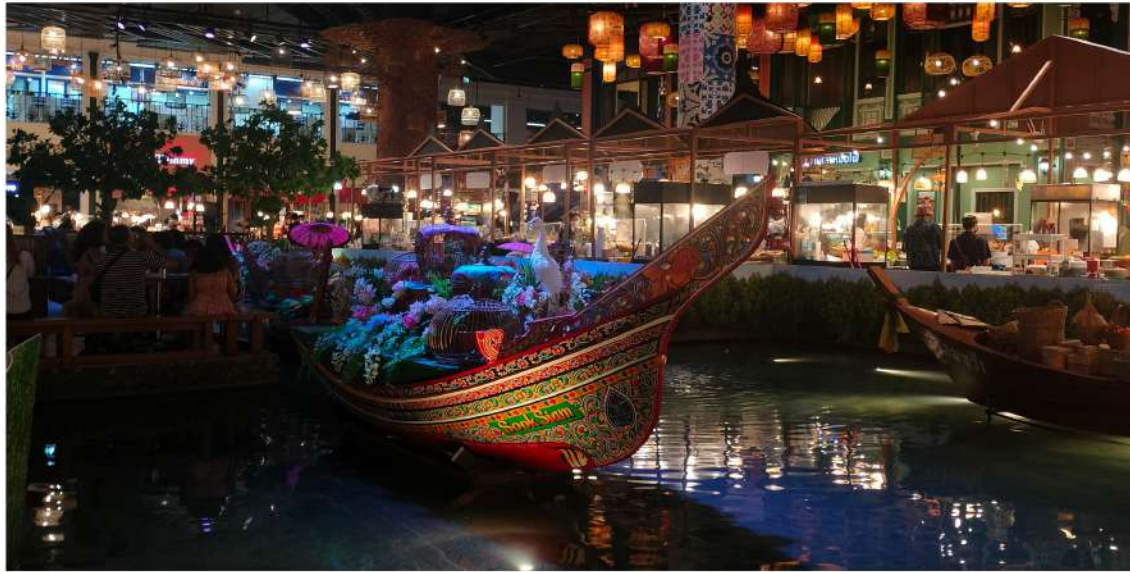
The New Year's Eve - Thailand. Druti Banerjee.

Indians flocked to different cities and islands of Thailand to experience the splendour of different parts of the country, enjoying a culture much similar to what Indians themselves are exposed to. On questioning a traveler about such a popularity of the said country for such celebrations, he said that the airfares are much cheaper in comparison to other countries and since Thailand is in Asia, the travel distance isn't much. From any Indian International Airport, it takes a maximum of four hours to reach Thailand.